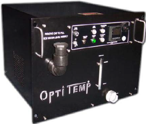
Model OTI-R1W to R15W shown

A Partial List of Process Cooling Markets: Aero. & Defense, Digital Printing, Food & Beverage, Mobile Imaging, Plastics Photonics, Research, & Semi-Conductor.